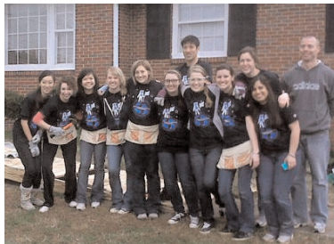
- Boston University Alternative Spring Break Group, 2011

Thank you so much for allowing us to stay at your church. Your hospitality made our time here that much more enjoyable! As a whole, our program - Alternative Spring Break - continues to be extremely grateful of your support. Once again, thank you so very much...we all enjoyed Nashville immensely!